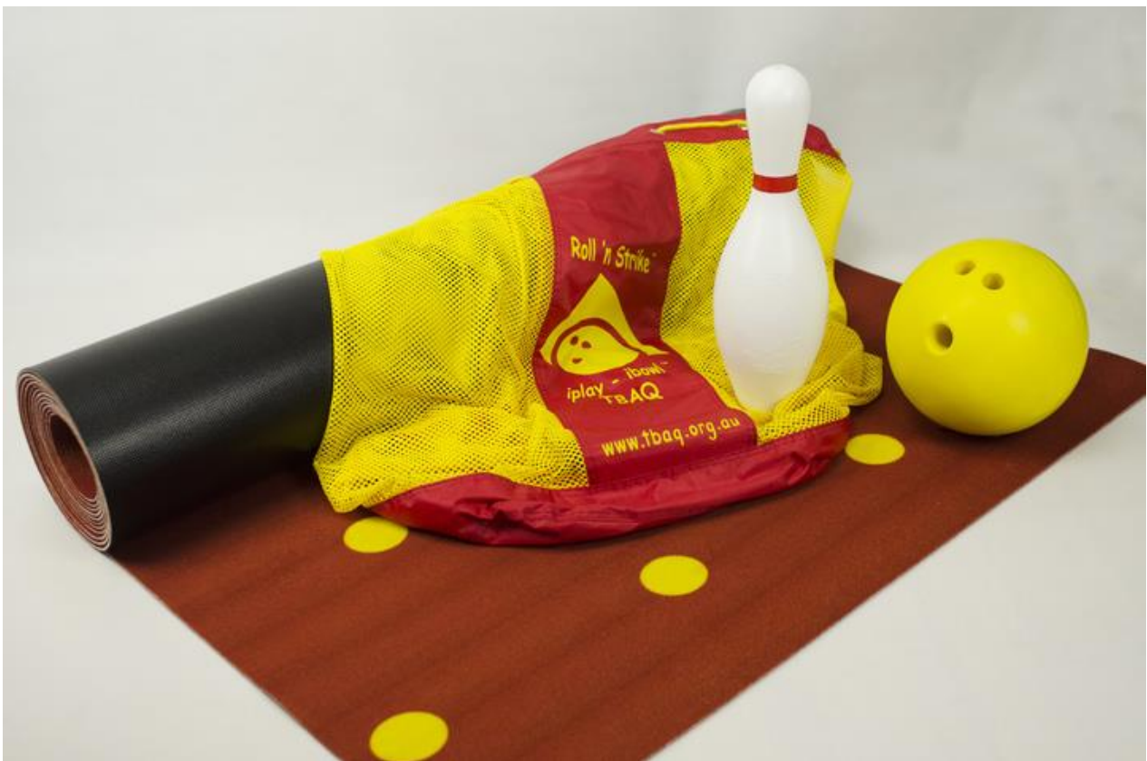
(Pictured: Roll 'n Strike Lane – 5 lanes per kit)